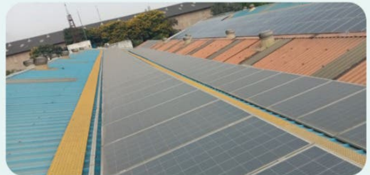
300 KW Industrial Boisar