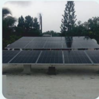
8KW Residential Palghar