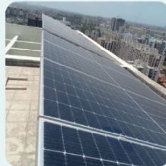
63KW Housing Society, Pune