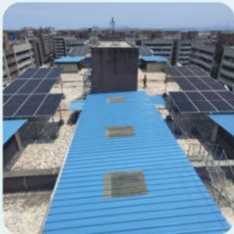
20KW Housing Society, Virar