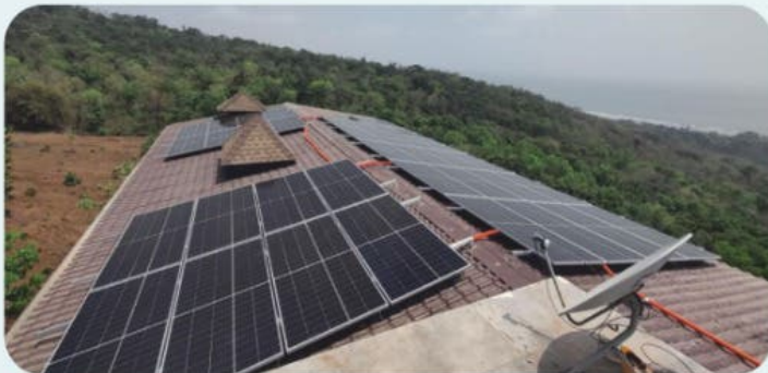
Dapoli 48 KW commercial project