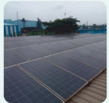
205KW Industrial, Sarigam